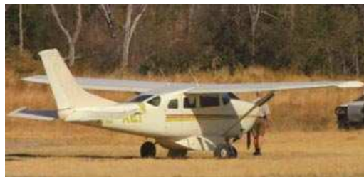
Typical plane used to fly you between lodges. (Known as “Botswana Taxi” of the sky!!)

NOTE: We have another special running for the same period – 1 Dec 2011 until 31 March 2012, at other lodges in Botswana. These lodges are more budget, not as luxurious, not necessary as well known so less crowded – but all offer fabulous wildlife viewing and an awesome safari experience. We call this alternative package special – the “Kalahari Summer Special”. Click on the following to download the information on it: http://www.absafaris.co.za/pps/KalahariSummer12.pdf